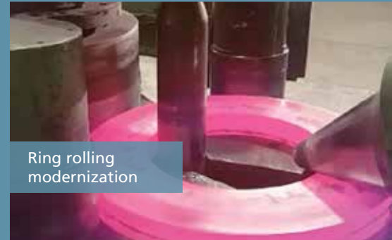
Ring rolling modernization