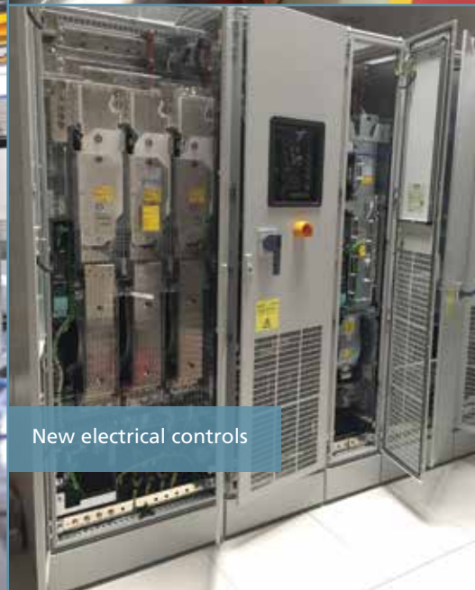
New electrical controls