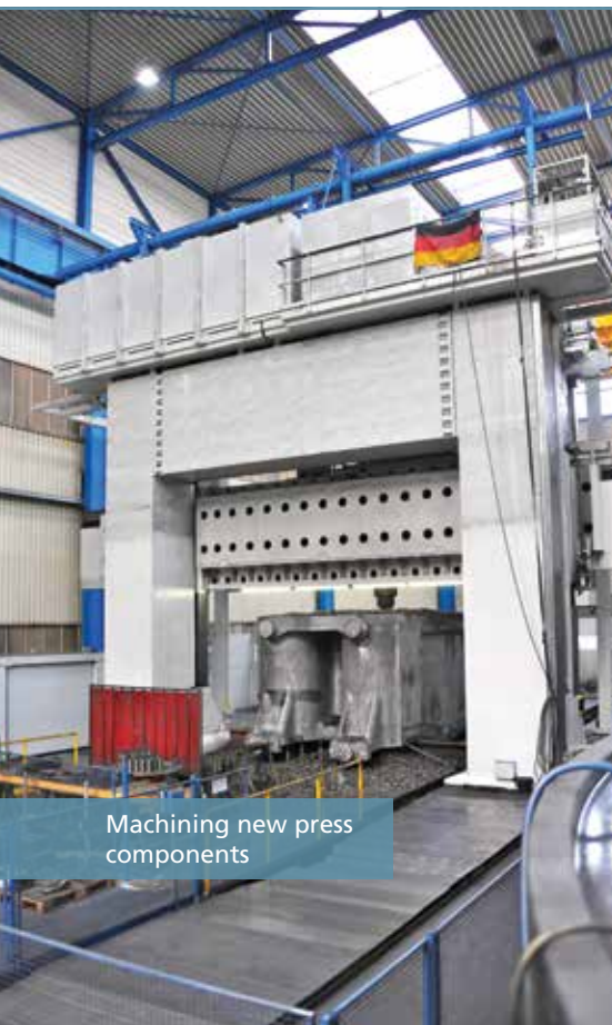
Machining new press components