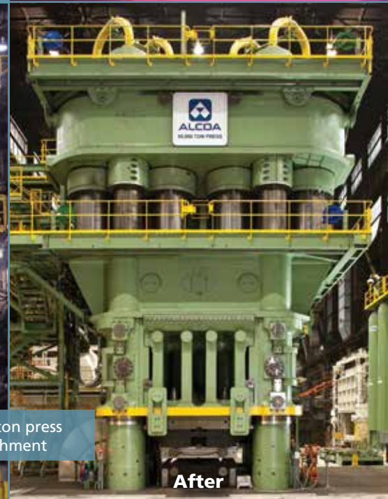
50,000-ton press refurbishment